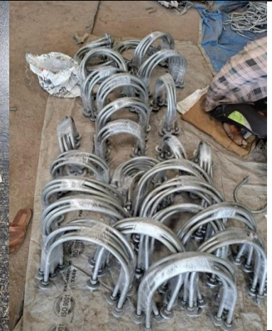
U BOLT WITH HDG