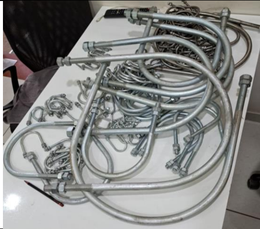
U BOLT WITH GI