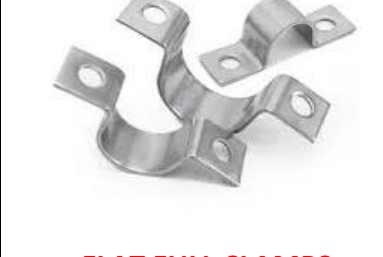
FLAT FULL CLAMPS