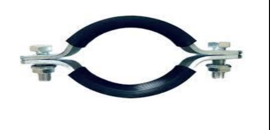
PIPE CLAMPS WITH GASKET