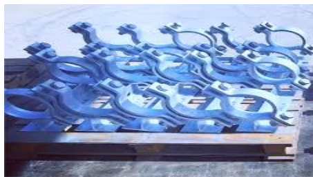
SHOE CLAMPS WITH BEAM