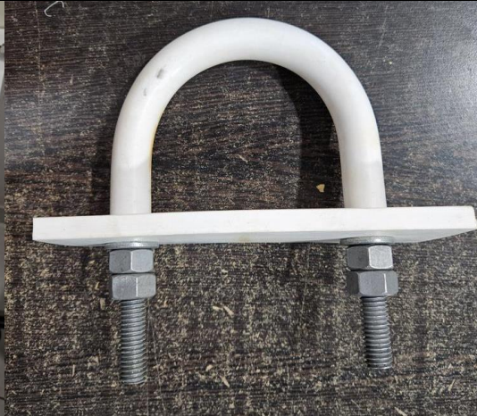
U BOLT WITH SLEEVE TEFLON TYPE